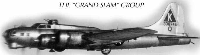
B-17 Flying Fortress

379th Bombardment Group (H) Formed at Wendover, Utah – December 1942 Moved to Kimbolton Hunts, England – May 1943 AAF Station 117 Activated for 2 years, 7 months, 29 days